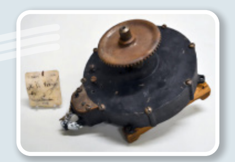
HYDRAULIC ENGINE PATENT MODEL AND TAG, 1879

Both the insect and the ink damage point to former storage in a damp area. Current storage conditions below 60 percent humidity will reduce further paper damage from ink corrosion. Patent labels in the museum are now kept in plastic sleeves. These practices prevent munching and snacking by insect pests.