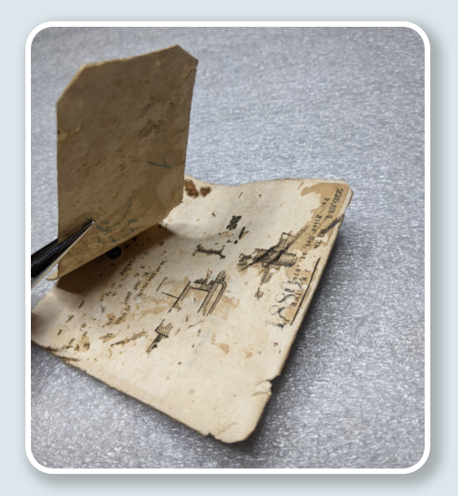
THIS SIDE OF THE TAG IS MISSING A SIGNIFICANT PART OF ITS LABEL BECAUSE INSECTS FOUND THE MATERIALS APPETIZING.