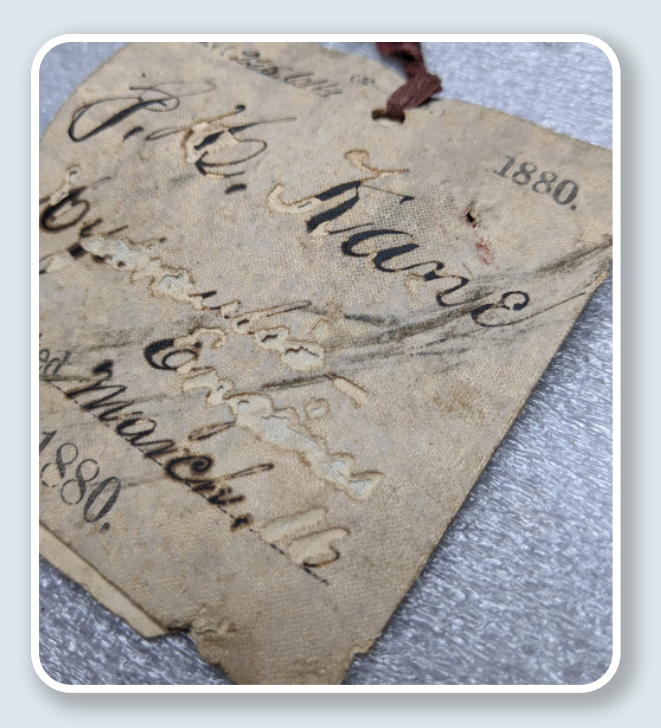
A PATENT MODEL TAG WRITTEN WITH IRON GALL INK. THE INK HAS DEGRADED MUCH OF THE PAPER, LEAVING HOLES WHERE THE WRITING ONCE WAS.

RE-CREATING A PATENT MODEL TAG - Patent model tags are especially fragile due to their age and material. Hagley creates reproduction tags for exhibitions outside of Hagley Museum, and in cases where the original tag is deemed too damaged or fragile to display.